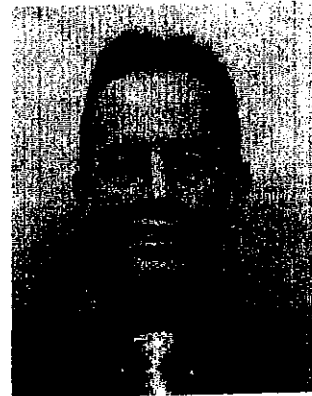
View full size