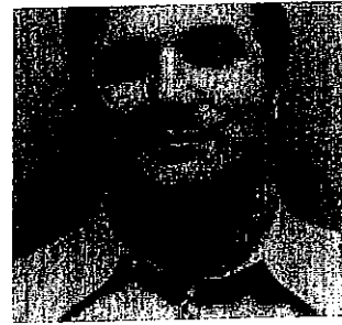
View full size