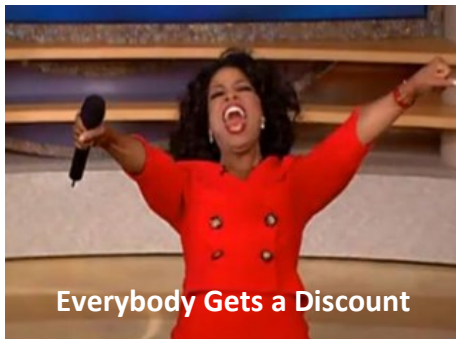
Everybody Gets a Discount